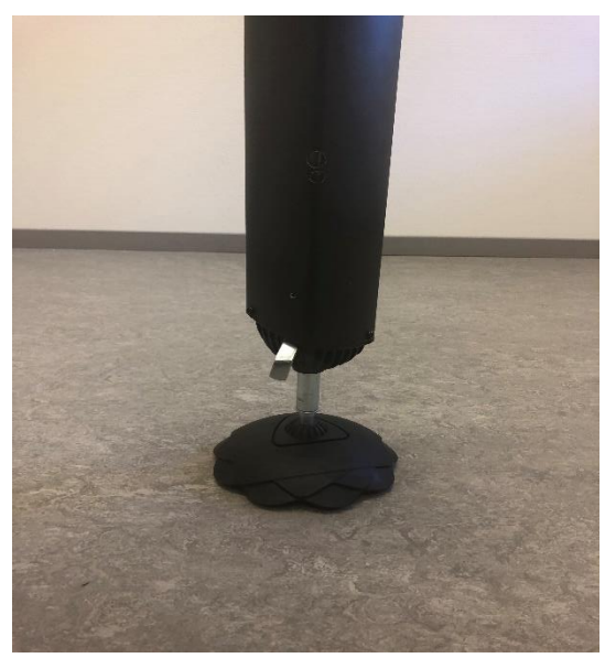
Figure 1 – Picture of tested object